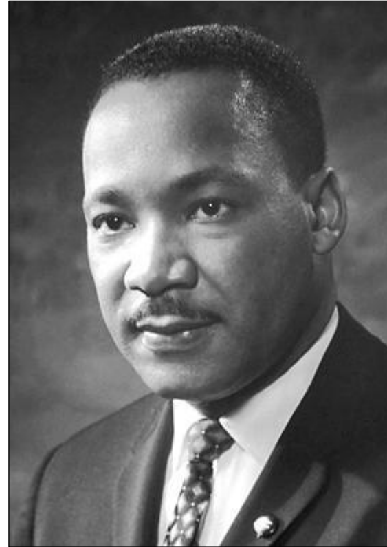
Dr. Martin Luther King Jr.