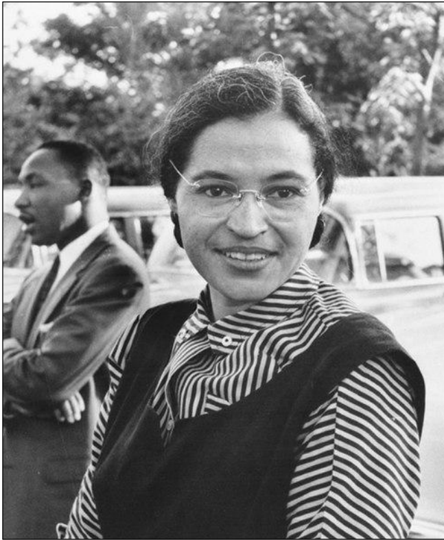
Rosa Parks (Image Source)